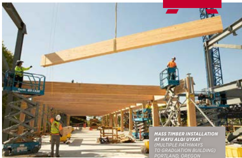
MASS TIMBER INSTALLATION AT HAYU ALOI UYXAT (MULTIPLE PATHWAYS TO GRADUATION BUILDING) PORTLAND, OREGON

ANDERSEN IS PROUD TO SPONSOR THE SAFEBUILD ALLIANCE GOLF TOURNAMENT.